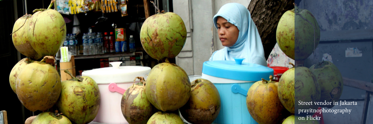
Street vendor in Jakarta