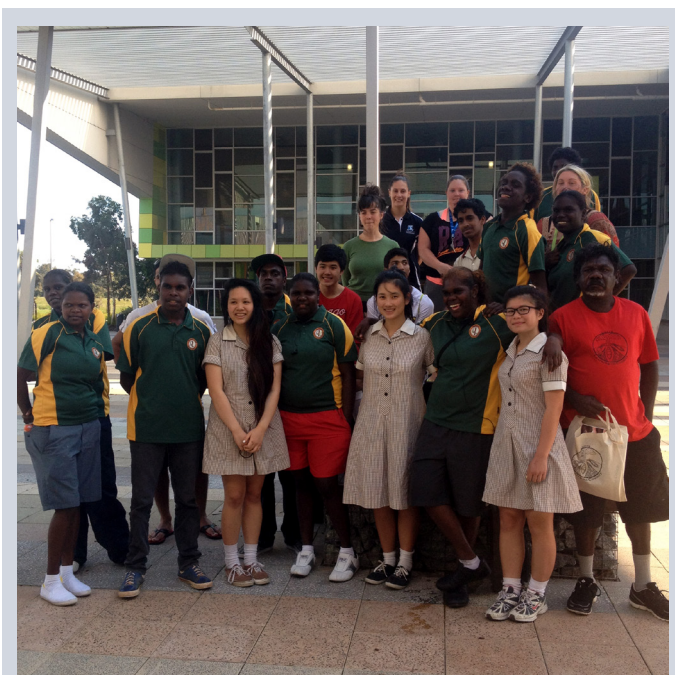
Students from Maningrida College visit Nossal High School, November 2013.

The project team supported the college in a successful application for an NAB Schools First grant to help improve vocational outcomes for students at the school.