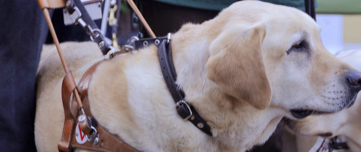
Guide dogs