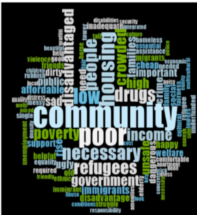
Private housing responses

We similarly agree with the focus on locating social and affordable housing in locations with access to jobs, public transport and services.