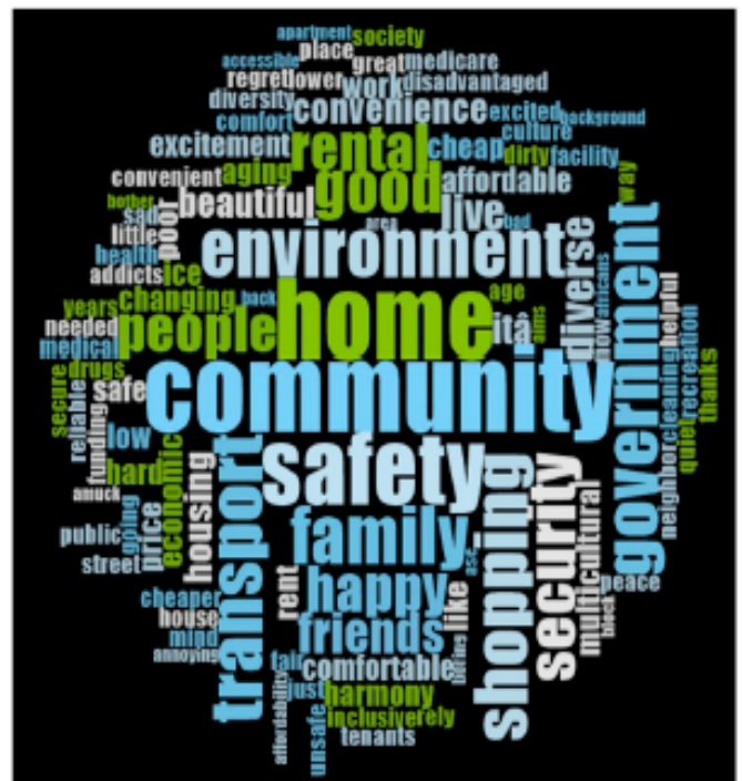
Social housing responses